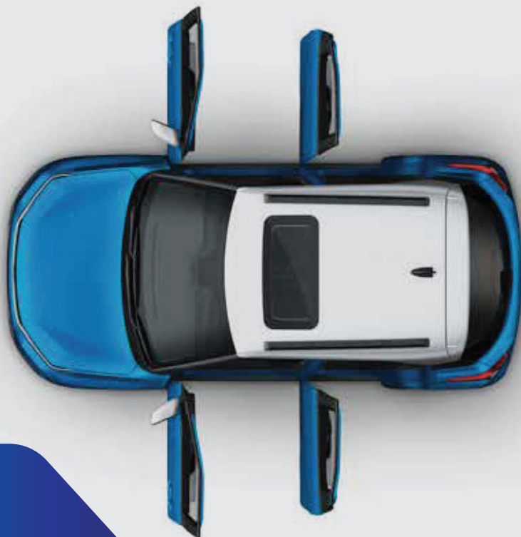
90-Degree Opening Doors for a hassle-free entry and exit