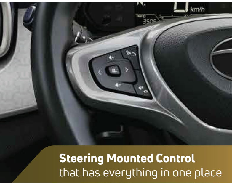
Steering Mounted Control that has everything in one place