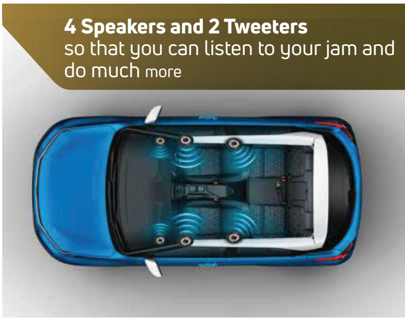
4 Speakers and 2 Tweeters so that you can listen to your jam and do much more