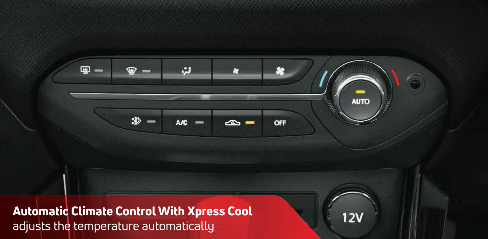
Automatic Climate Control With Xpress Cool adjusts the temperature automatically