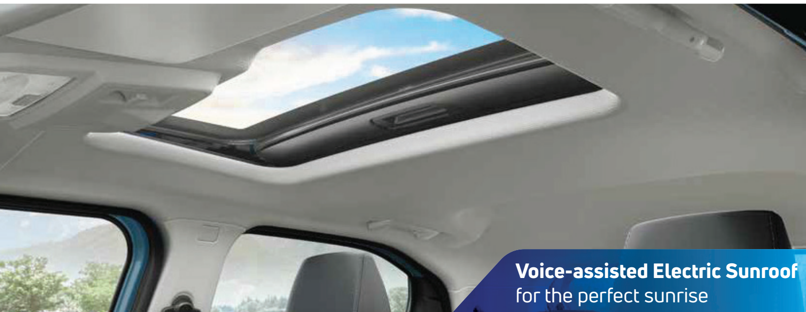
Voice-assisted Electric Sunroof for the perfect sunrise