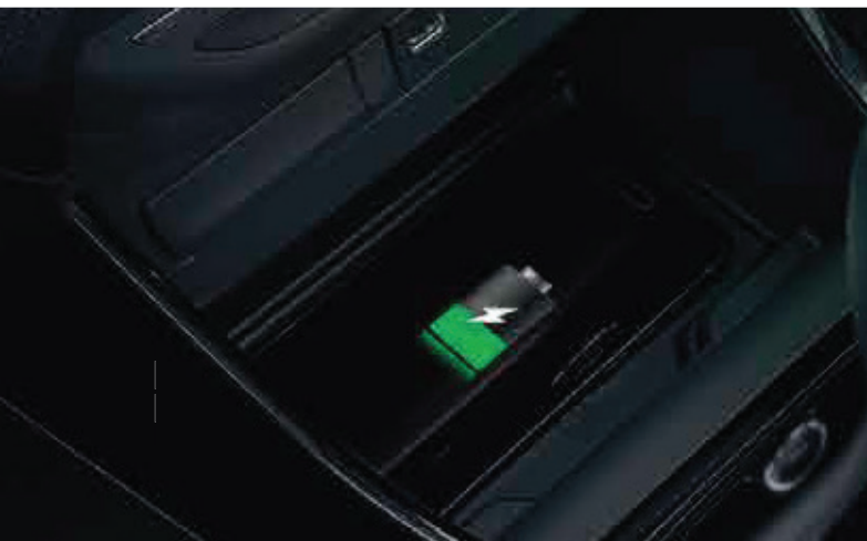
Wireless Charger & Fast C type charger so your electronic devices never run out of juice.