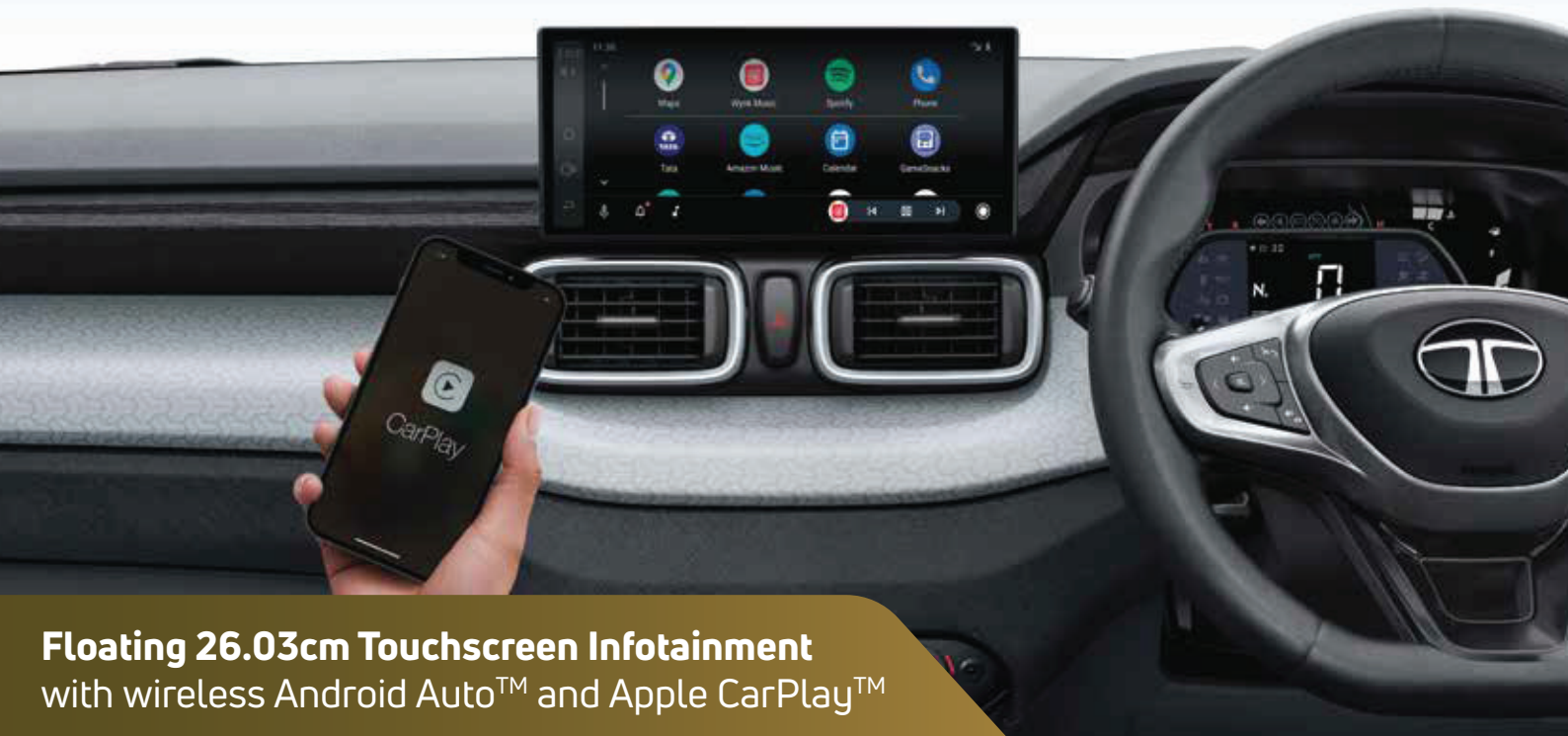
Floating 26.03cm Touchscreen Infotainment with wireless Android Auto™ and Apple CarPlay™