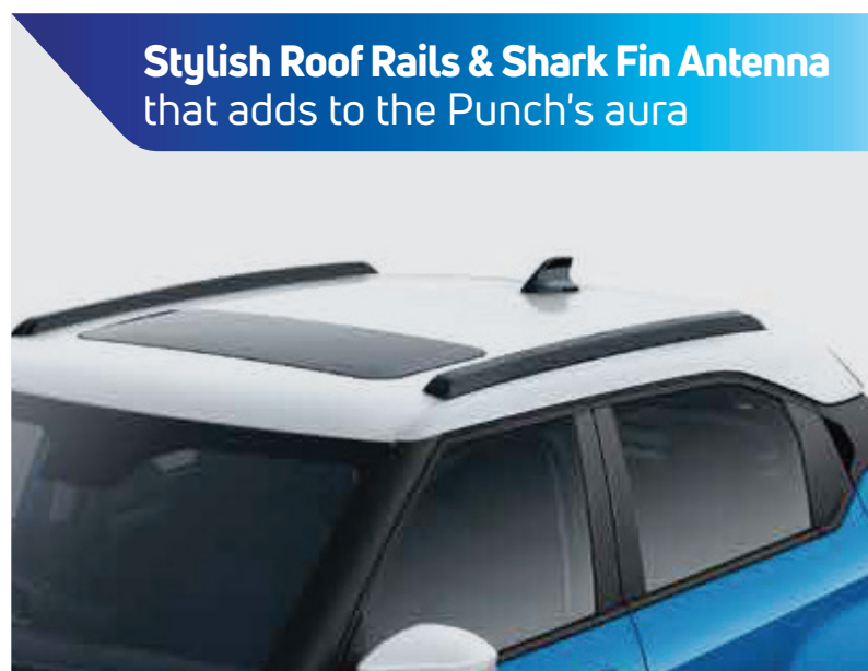
Stylish Roof Rails & Shark Fin Antenna that adds to the Punch's aura