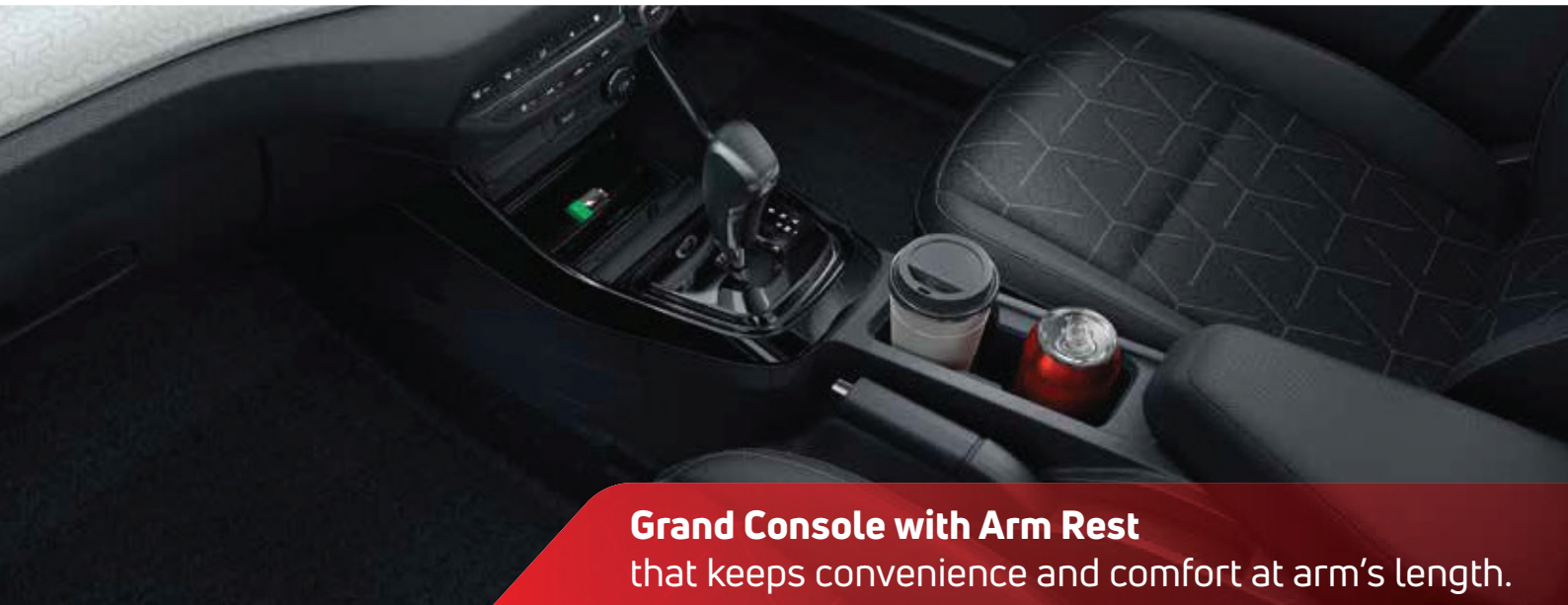
Grand Console with Arm Rest that keeps convenience and comfort at arm's length.