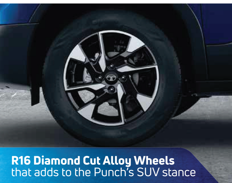
R16 Diamond Cut Alloy Wheels that adds to the Punch's SUV stance