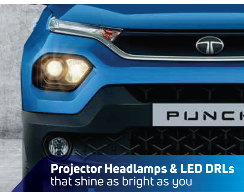
Projector Headlamps & LED DRLs that shine as bright as you