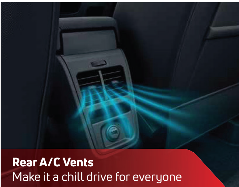
Rear A/C Vents Make it a chill drive for everyone

Rear Wiper & Wash | Auto Fold ORVM | Front Power Outlet | Fast USB Charger