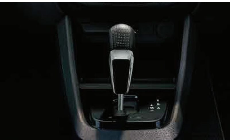
Leather Steering and Gear Knob for a more premium touch