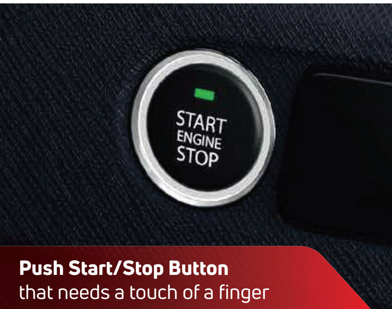
Push Start/Stop Button that needs a touch of a finger