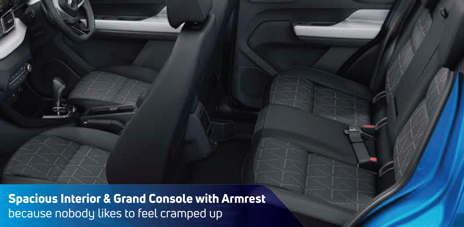
Spacious Interior & Grand Console with Armrest because nobody likes to feel cramped up